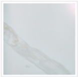
Golden Silk Carrara